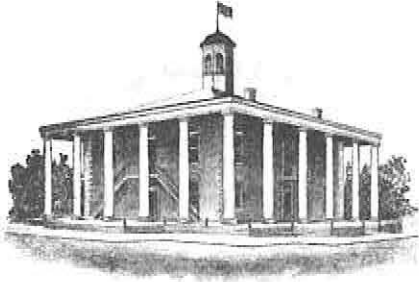
COURT HOUSE, HOMER, LA ERECTED 1857