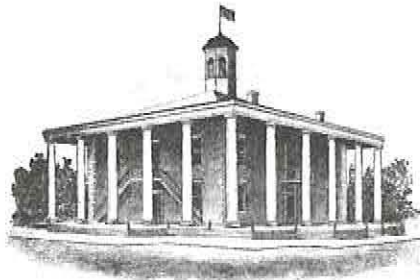
COURT HOUSE, HOMER, LA ERECTED 1857