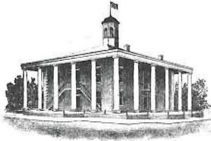
COURT HOUSE, HOMER, LA ERECTED 1857