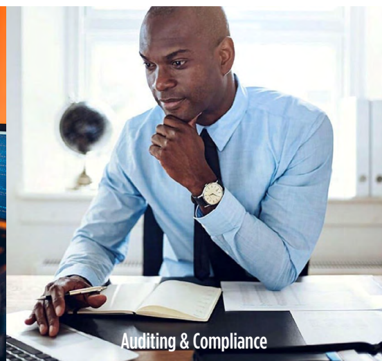
Auditing & Compliance

March 11-12, 2026 • In-Person and Livestream Pennington Biomedical Research Center • C.B. Pennington Conference Center 6400 Perkins Road, Baton Rouge, LA 70808